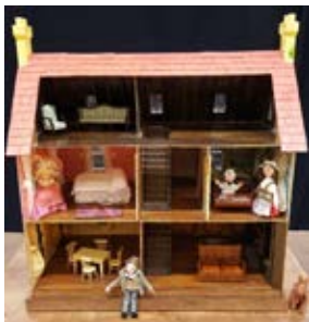
The Dolls House, Rag and Bone Puppet Theatre, 2016-17 Articipate Grant recipient

Windows Collective, One Take Super 8 Event: Ottawa Edition, presented at the Agora Minto-Orléans Outdoor Plaza. The Fund enabled a collaboration of local media artists to shoot new films and host a cinematic interactive experience for Ottawa audiences.